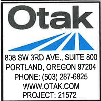
EXHIBIT A SLOPE EASEMENT IN PARCELS 2 & 3 OF PARTITION PLAT NO. 2018-10, IN THE SOUTHEAST QUARTER OF SECTION 1, TOWNSHIP 3 NORTH, RANGE 2 EAST, WILLAMETTE MERIDIAN CITY OF SCAPPOOSE, COLUMBIA COUNTY, OREGON MARCH 27, 2025