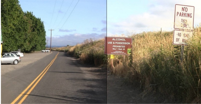
Example of signage along Reeder Road