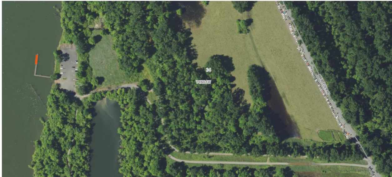
Gilbert River Boat Ramp (on the left side of the photo)

Columbia County operates and maintains a boat ramp facility at Gilbert River Boat Ramp to the east of Reeder Road at MP 4.69. The intersection for entering the boat ramp area is within the Collins Beach parking area.