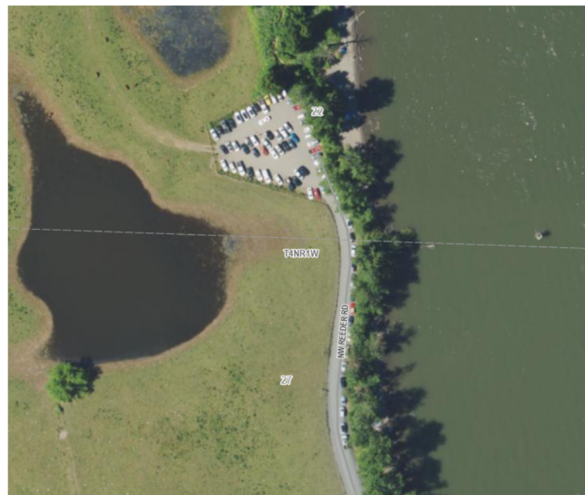
North Unit parking lot at end of Reeder Road

Reeder Road ends at the North Unit parking area at MP 6.00. This is a relatively small parking lot with no clear parking stalls, so vehicles park their own way. It is hard to tell what capacity may be, but looking at aerial photos, it appears to be about 50 to 60 vehicles. As this parking lot fills, vehicles begin to park outside the lot along the edge of Reeder Road, against regulation.