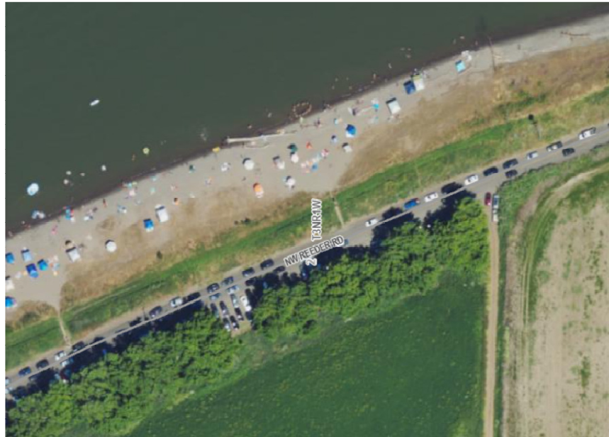
A portion of Walton Beach parking area on a busy day

The photo above shows the queuing of traffic on the northbound lane of Reeder Road as vehicles try to find parking at Walton Beach. ODFW has said this is a common occurrence and can last for a long time, essentially narrowing the road down to one lane for emergency access.