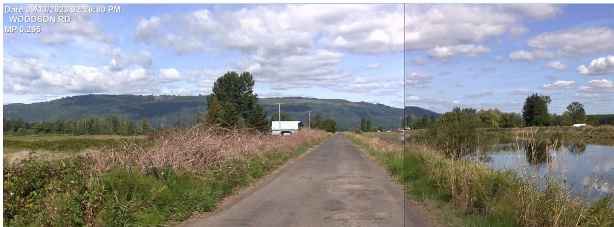
Woodson Road looking North toward Webb District Road intersection

The subject section of Woodson Road is paved and is characterized as narrow, perched on top of the constructed dike, and in need of pavement preservation to dig out base failures and address potholes. Since the right-of-way issue was brought up, the neighbors have been performing some maintenance on this road to keep it passable.